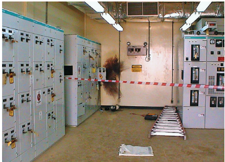
March 4, 2009, at the Jubail Project in Riyadh, Saudi Arabia. Three workers were removing a 480-V, molded-case circuit breaker from the bucket of an energized motor-control center (MCC) when an electrical arc flash occurred, severely injuring them. All three sustained first- and second-degree burns and were hospitalized following the accident. Myth: Switchgear is designed with arc-flash containment in mind.

For these reasons, the best way to determine the arc-flash danger for a given device in a given installation is to use IEEE's standard 1584 arc-flash calculations based on actual test data for the given device at a given installation.