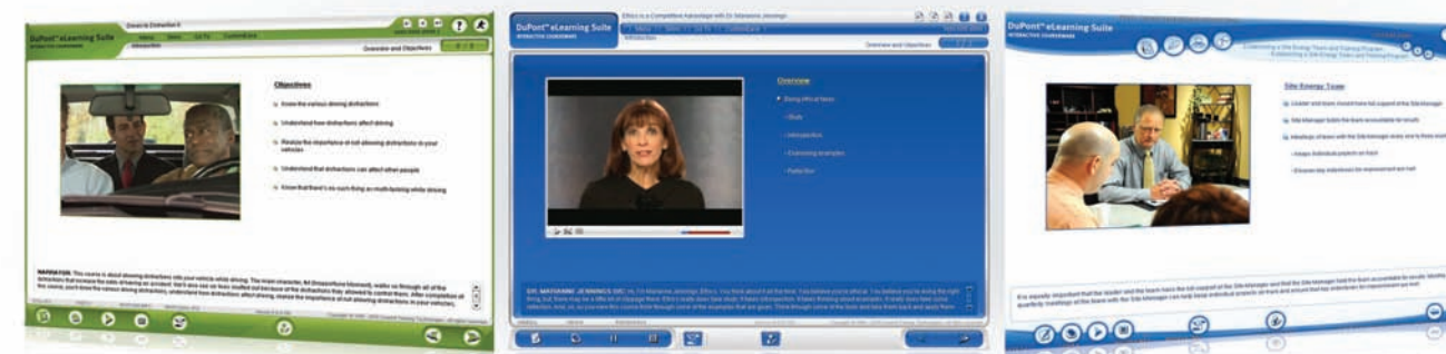
Driven To Distraction II

Bring learning to life with engaging content from DuPont.